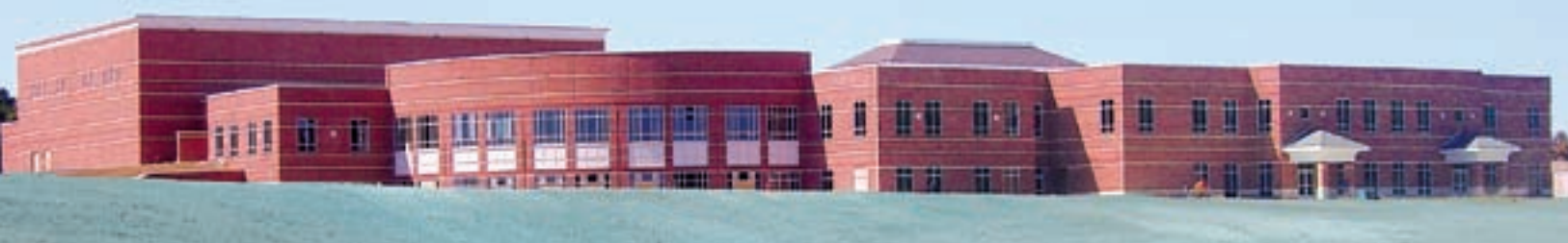
Severns Valley Baptist Church will be relocating to 1100 Ring Road. Their new 109,000-square-foot facility will have a multi-purpose worship center with seating capacity for approximately 1,400.

Dixie Avenue you will find a new Home Depot, Energy Sports and Fitness Club, John O's, and soon to be completed American Legion and Severns Valley Baptist Church.